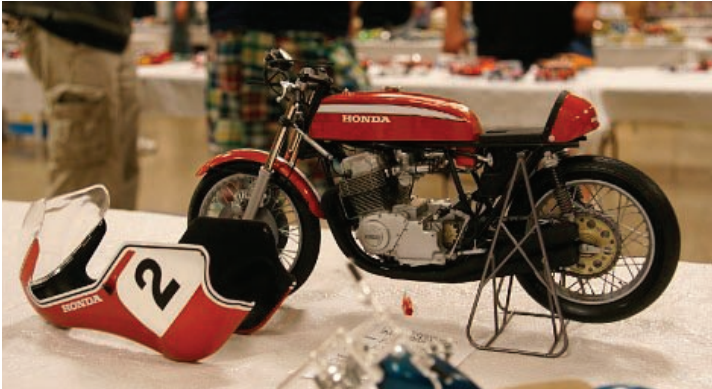
Some photos from the NNL North #11