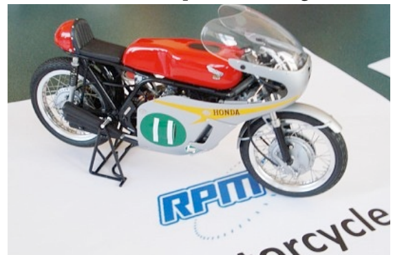
Jim Mulligan - Best Motorcycle