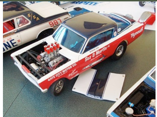
Erik Zabel - Straight Line Competition