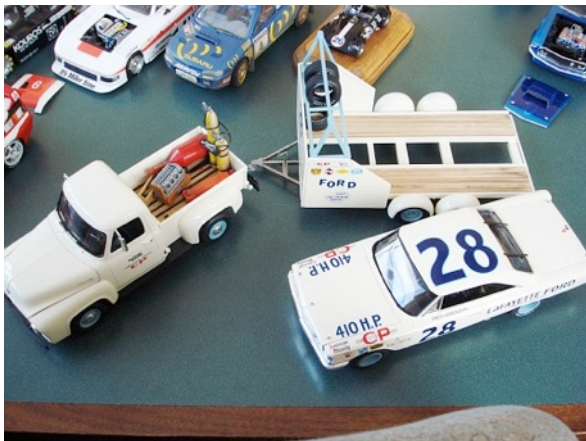
Torben Rothgeb - Closed Wheel