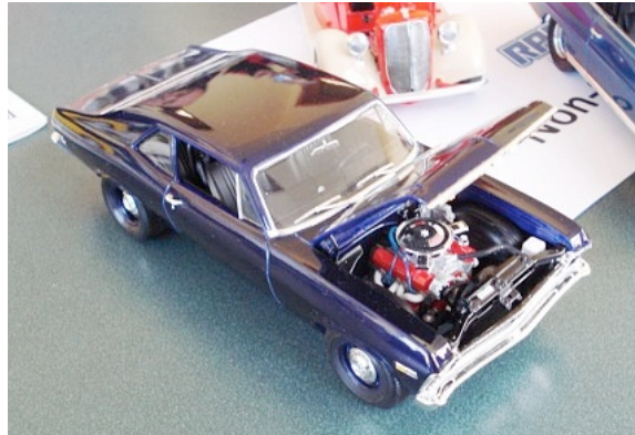
Jim Allen - Best Non-Competition