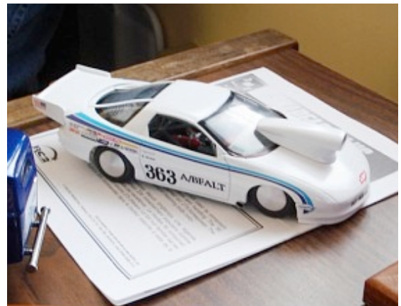
Tim Graf - Snap-Kit Challenge